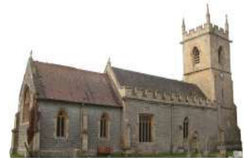
Hinton on the Green